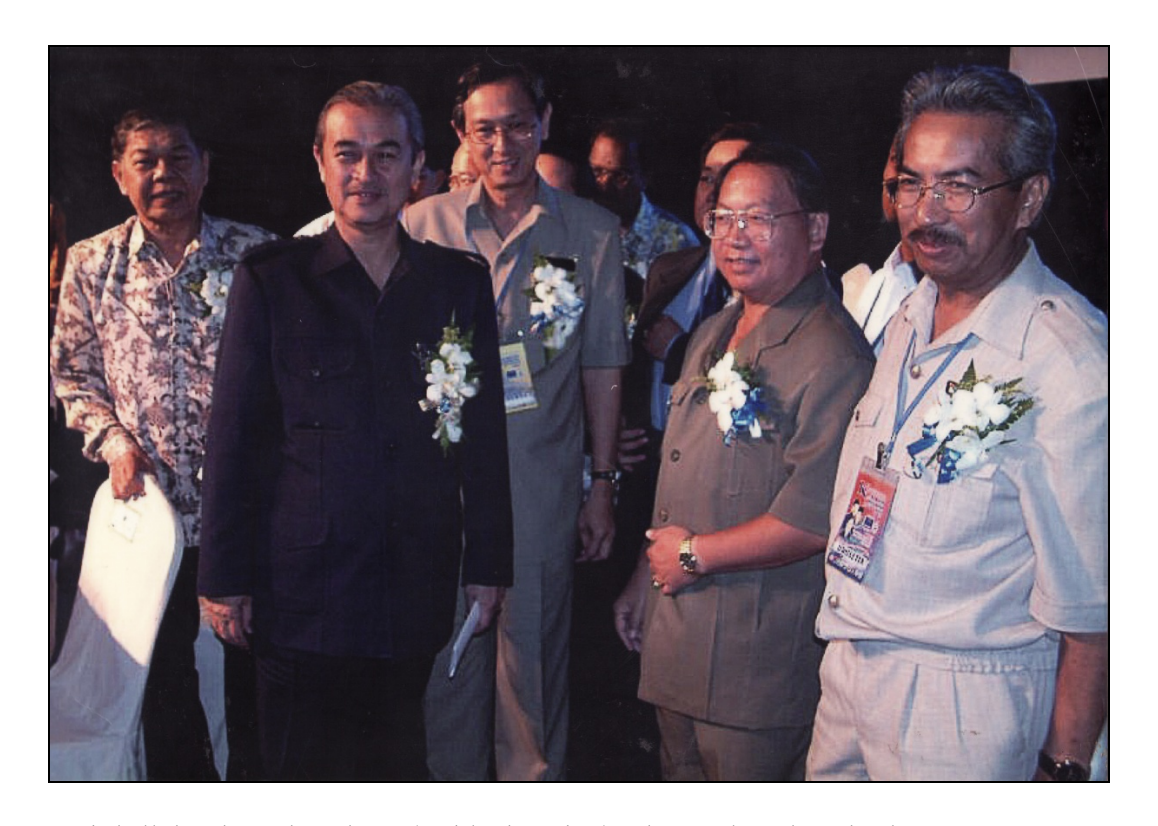
Picture 3: Abdullah Ahmad Badawi (in black jacket) who replaced Mahathir as Prime Minister was seen as the key figure to influence BN to accept PBS back into the national coalition. Seen here from right to left are Musa Aman (current Sabah Chief Minister), Pairin (who is now Musa's deputy), Chong Kah Kiat (former Sabah Minister of Tourism), Abdullah, and Mohammad Rahmat (former federal Minister of Information).