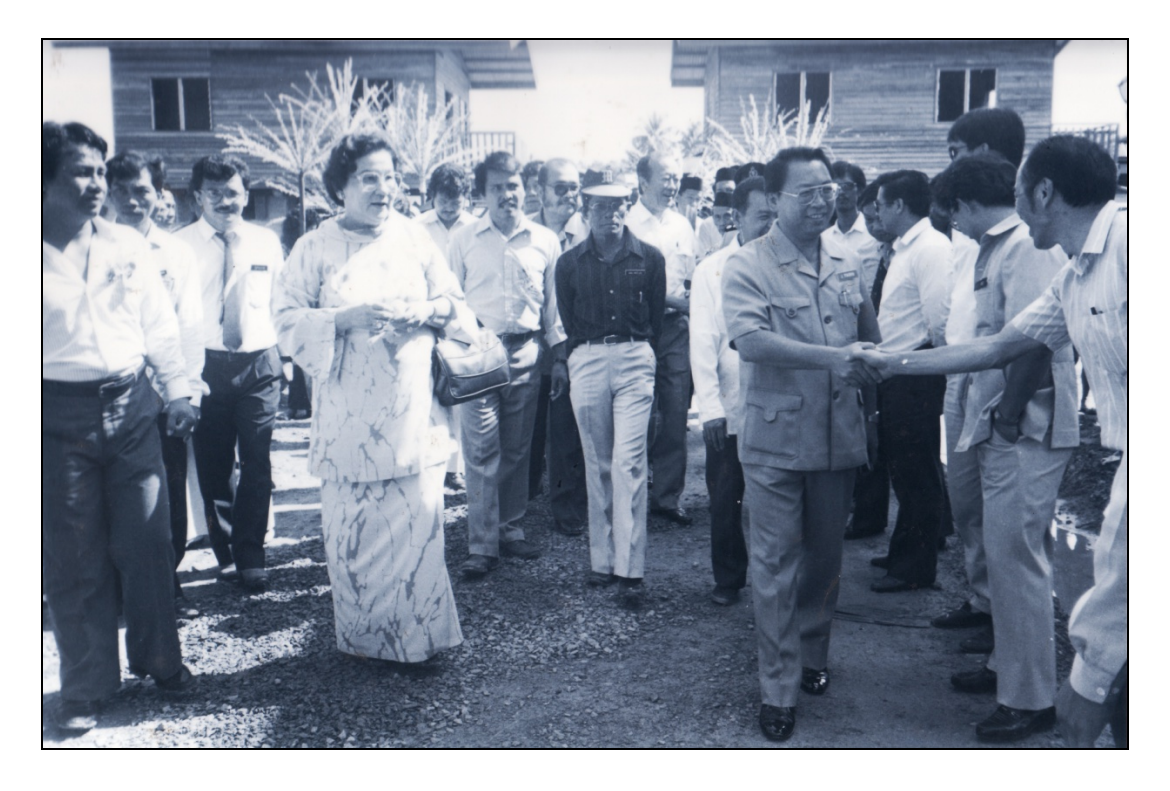
Picture 1: Joseph Pairin Kitingan during the early days of PBS's rule. Pairin was seen as an emerging "Sabah champion" and was hugely popular among the rural people who regarded him as a "folk hero". On Pairin's right is Tengku Ariah Ahmad, Sabah Minister of Social Services (photograph courtesy of Parti Bersatu Sabah (PBS).